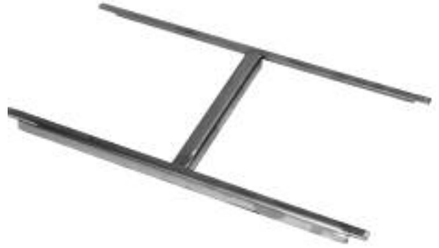
H Bar Adapter for 1/6 Size Pans TB000004