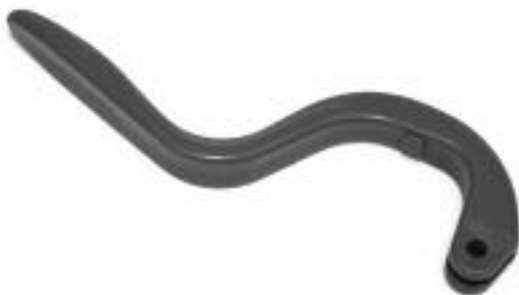
Handle, Squeeze Valve 001120-45