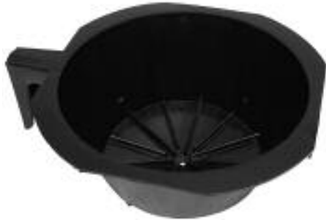
Brew Chamber, Black 8942-6B