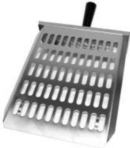
Spatula (Includes Items 17 & 18) 7000643