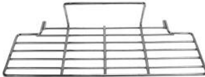
Basket Support Rack, Dual Vat 803-0133