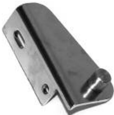
Door Hinge (Top Left Hand, Bottom Right) 3234072