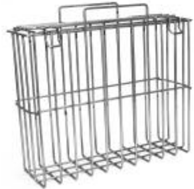
Basket, Wide B4511601