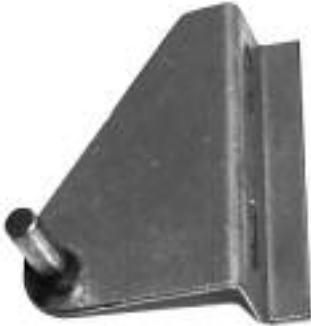
Hinge, Bottom Right Hand Door (Gas/Electric) B3801601