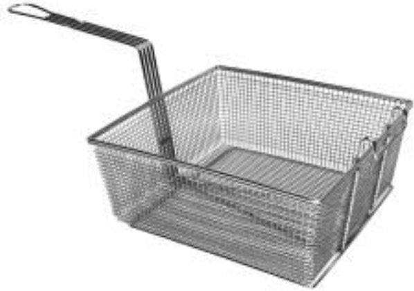
Basket, Full 803-0099