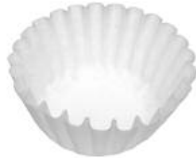
Filter Paper (case of 100) POF