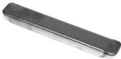
Adapter Bar (6.62" x 1") TB000011