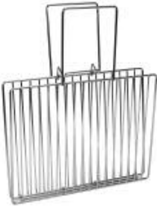
Basket, Suitcase B4511101