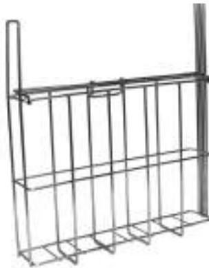
Basket, Narrow B4511501