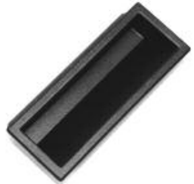
Handle (Gas/Electric) PP11006