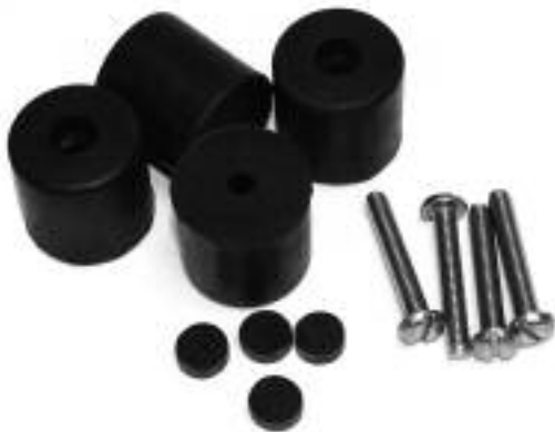
Bumper, 1" Leg Kit 210K230