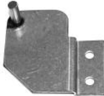
Hinge, Top Right Hand Door (Gas/Electric) B3801501