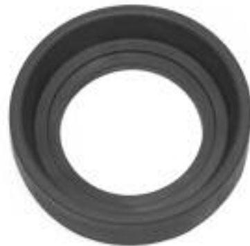
Ring, Rubber 007861-45