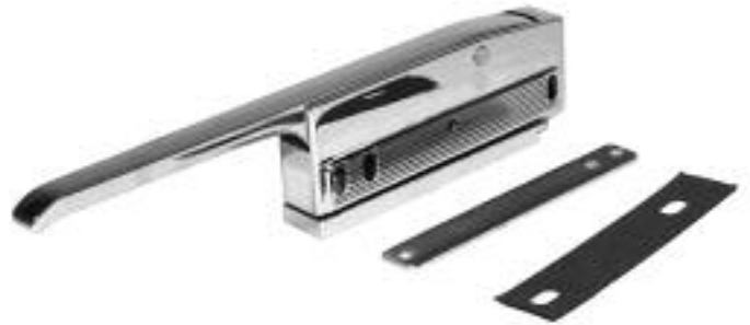
Door Latch, Magnetic w/ Strike 84688