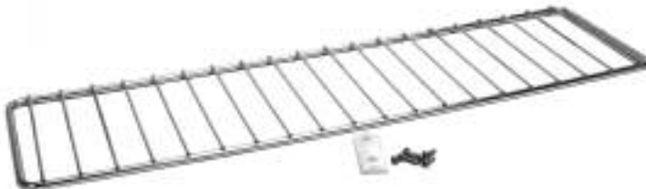
Drip Plate (5.87" x 21.06") TBP00009