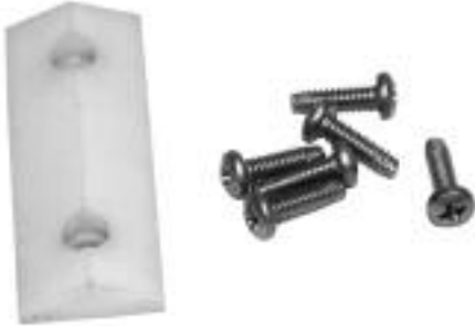
Steam Door Plastic Wedge (.30" High Spini Line, Mini-Line) TB600401