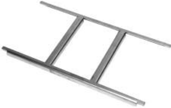
H Bar Adapter for 1/9 Size Pans TB000003