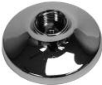
Spray, Cup 000019-40