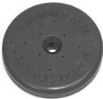
Spray Face 001121-45