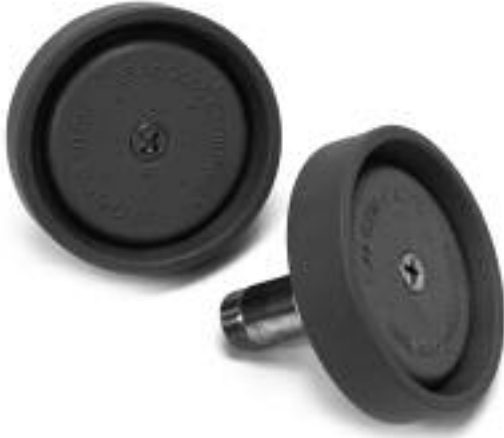
ASM, Spray Head 002859-40