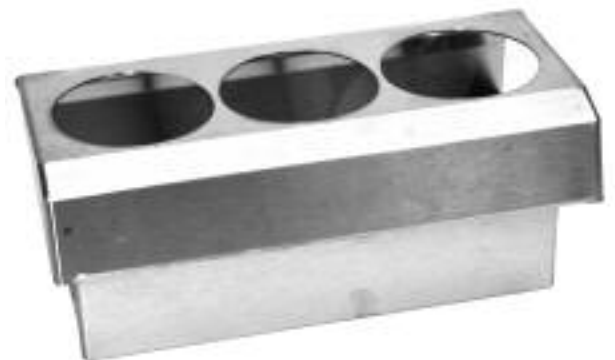
Sour Cream Gun Holder TB000010