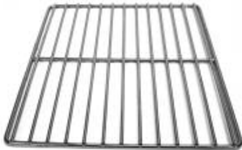
Basket Support Rack, Full Vat 803-0132