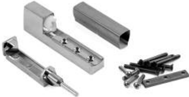
Hinge, Complete 84808