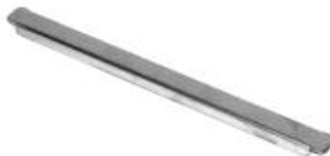
Adapter Bar (12.75" x 1") TB000012