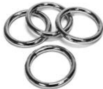
Ring, Hold Down 000907-45