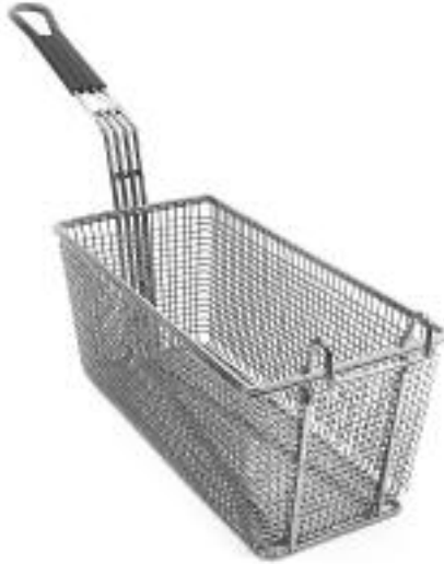
Basket, Twin 803-0271