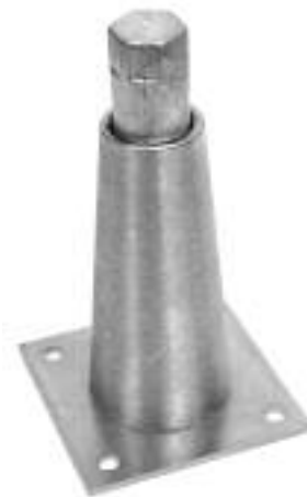
Leg, 6" 84696