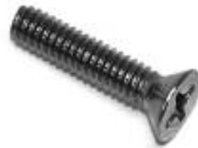
Screw, Spray Face 000913-45