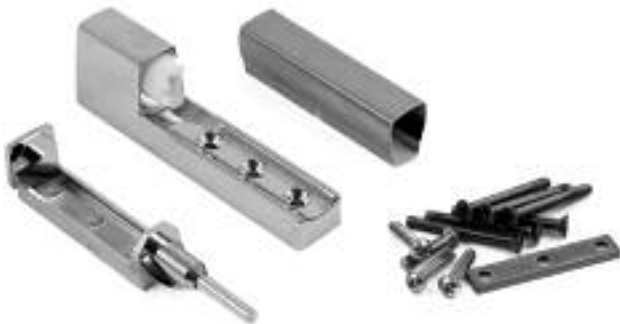
Hinge, Complete 84808