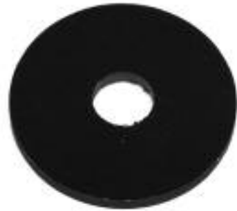
Guard, Handle 2100249