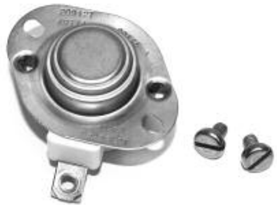
Hi-Limit Thermostat 4030222