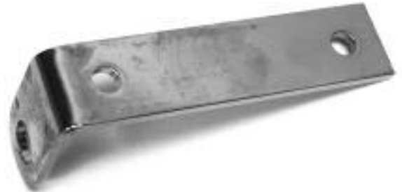
"L" Shaped Hinge, Stainless Steel 3234391