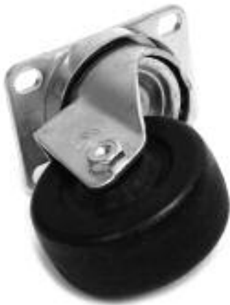
Caster, 3" HRD, Swivel 80108