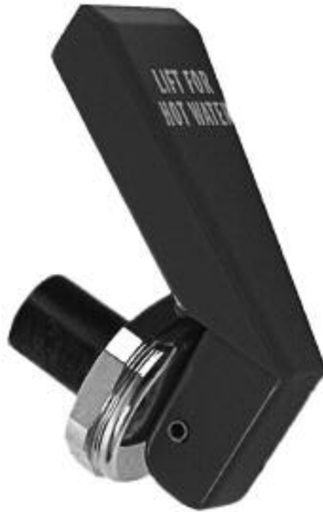
Faucet Handle/Stem Assembly 13061