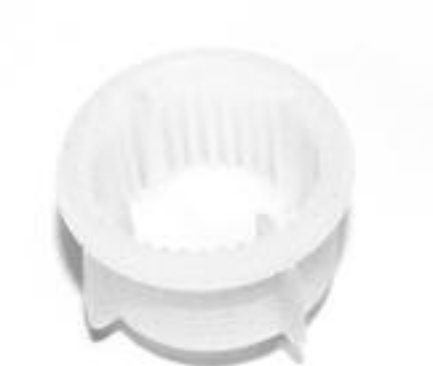
Inlet Fitting Kit (Items 45-10, 45-11, 45-12, 45-13) 85218