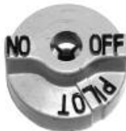
Knob, Gas Valve P6071267