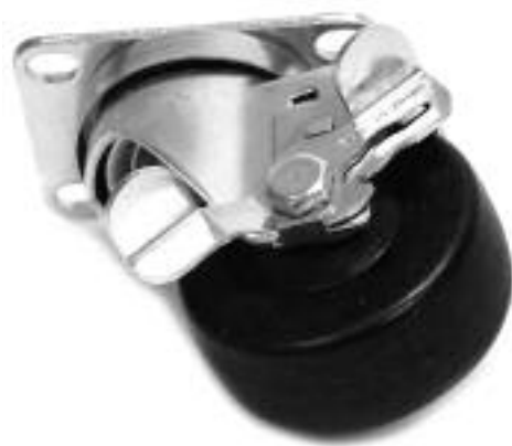
Caster, 3" HRD, Swivel w/ Brake 80112