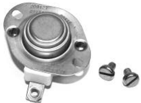
Hi-Limit Thermostat 4030222