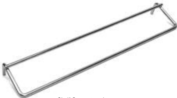
Shelf Supports, wire 84526