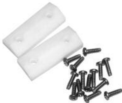
Steam Door Plastic Wedge MDL (-2" x .43") TB600400