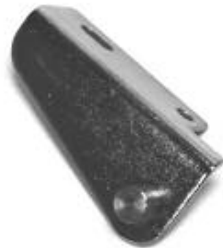
Door Hinge (Bottom Left, Top Right) 3234073